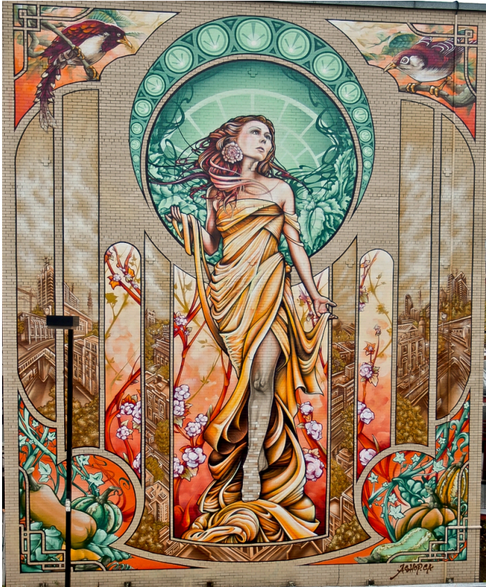
Our Lady of Grace Mural by 'A' Shop