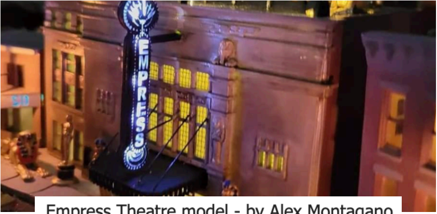
Empress Theatre model - by Alex Montagano

For many years one of the hottest topics across NDG was what to do with the Empress Theatre following the fire which tore through the inside of the building. While many groups have tried, no one has succeeded to date. In 2021, the city called out to the community to submit ideas for rebuilding. You can see the different proposals here: Transformation of the Empress.